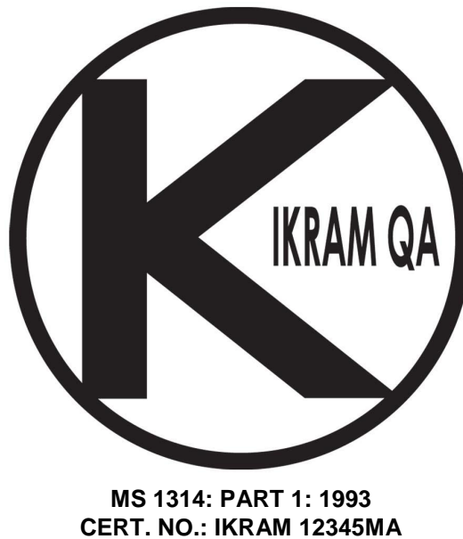
(b) The K-MARK where text located at the bottom