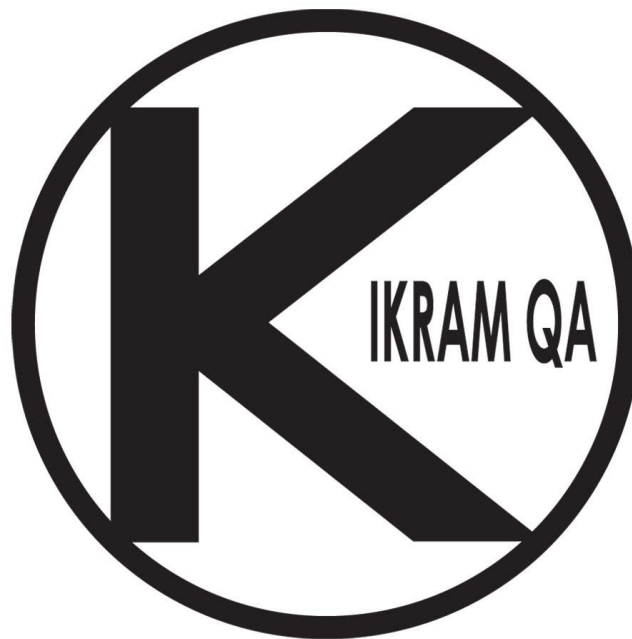
Figure 1: K-MARK logo

IKRAM QA reserves the rights to amend this document whenever deemed necessary.